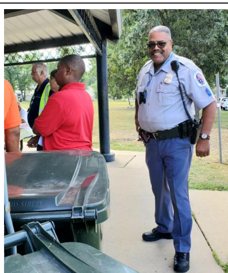
Prince George's County Officials Walk-Thru Meeting with the Birchwood-Clearview Community, 8-29-22.