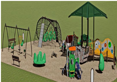
Playground design similar to the new Birchwood Park Playground design