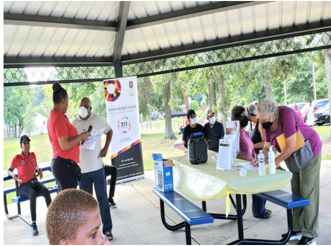
Prince George's County Officials Walk-Thru Meeting with the Birchwood-Clearview Community, 8-29-22. To see additional picture, please go to https://photos.app.goo.gl/FyVz3aCPU2jwq32T7