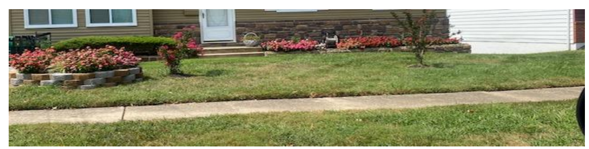
A few pictures of yards taken during my field trip