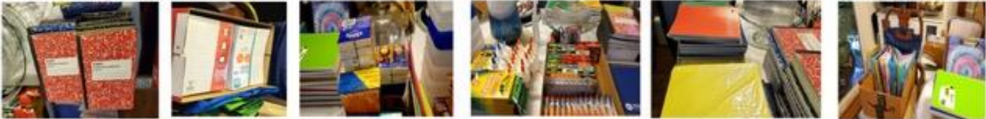
These pictures represent the assemble lines of supplies for each grade of primary education experiences.